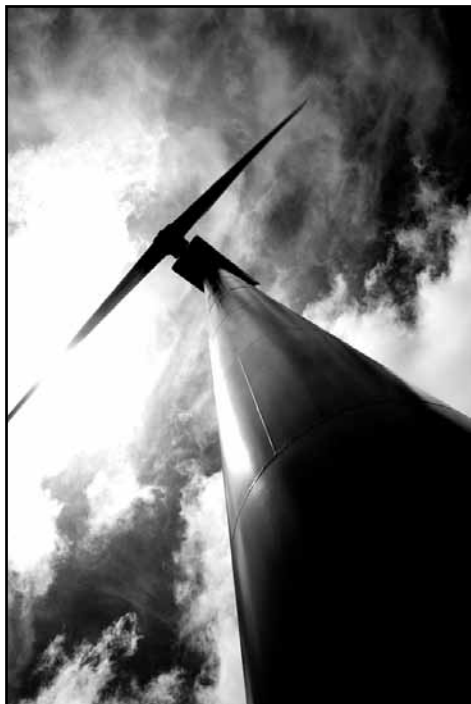
A Windflow turbine, from www.windflow.co.nz

Let's imagine that the current wind testing (at sites on the ridge below Mopanui and off Double Hill Rd) gives results showing we have the perfect wind profile for a 500 kW wind turbine. Where to from there? At our June 17th OERC-WEP meeting Bob Lloyd, head of Energy Studies at the University of Otago was very clear about the immediate necessity to construct renewable generation. Essentially, Bob argues, as we enter Peak Oil we're entering an 'energy crunch'. You need energy to build energy generators: wind turbines and solar panels need to be built now using oil and gas (in fact they needed to be built 20 years ago). In 30 years the world will have half the easy energy we have now and the climate change challenges along with population pressures will further complicate an already very difficult predicament: how to build infrastructure with even fewer resources and many more demands on what we have? Bob offers a clear rational voice when it comes to formulating action on renewables.